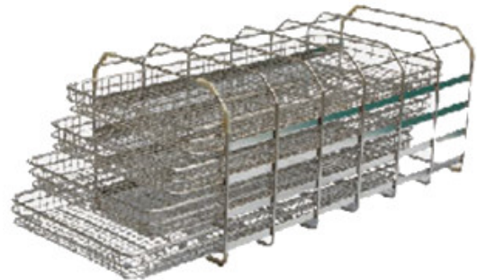
Tray load rack + 4-level rack