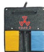
Monopolar Double Pedal Footswitch