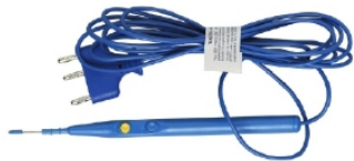
Disposable Hand Switch Pencil