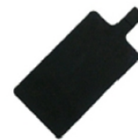
Silicon Patient Plate