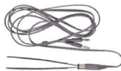
Bipolar Forcep Autoclavable