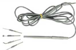
Chuck Handle with Electrodes Autoclavable